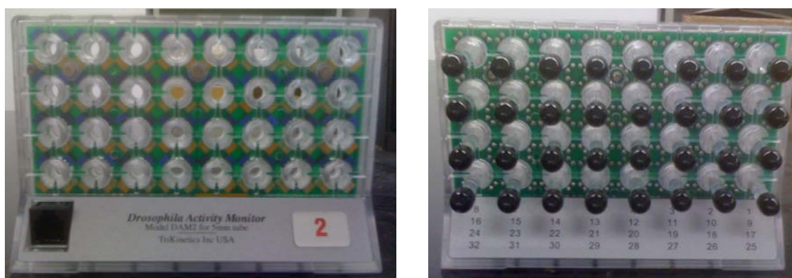
Figure 1a (left) and 1b (right). a) An example of a DAM, specifically model DAM2. The DAM2 connects to the computer and power source via the standard 4-wire telephone jack in the bottom left corner. b) Thirty-two individual flies are placed into tubes with an agar-sucrose food, covered with a black cap (shown), and capped off on the other end with cotton (not shown).

As Klarsfeld et al. (2003) reports, studies have shown that different devices were invented to observe the behavioral circadian locomotor activity rhythm in fruit flies (Hamblen et al. , 1986; Helfrich 1986), but currently, the most widely used are the Drosophila Activity Monitors (DAMs), such as the devices built by the company Trikinetics (Waltham, MA) (Klarsfeld et al. , 2003) (Figure 1a). Previous articles describe the actual process of setting-up the computers and monitors, and placing the flies into the individual monitor tubes (Rosato and Kyriacou, 2006) (Figure 1b) – in particular, Chiu et al. (2010) provides detailed instructions beginning with incubator set-up to data analyses. Essentially, the DAMs monitor the activity of individual flies by counting the number of infrared beam crossings within a 10-min time period or bin, and subsequently compiling the activity in a raw data text file (Klarsfeld et al. , 2003; Rosato and Kyriacou, 2006; Chiu et al. , 2010; Pfeiffenberger et al. , 2010). It is then necessary to utilize a separate data-analysis program, such as ClockLab (Actimetrics, Wilmette, IL) or VitalView (Minimitter, Bend, OR), in order to extract the information from the raw-data file and to produce an actogram, which is a graphical representation of the individual fly's activity.